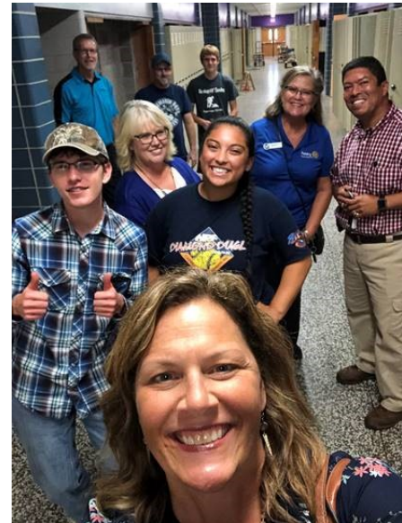
photo: Martin County Substance Abuse Prevention Coalition Members at the Truman School Board Meeting

Four Minnesota tribes join lawsuits against opioid industry.